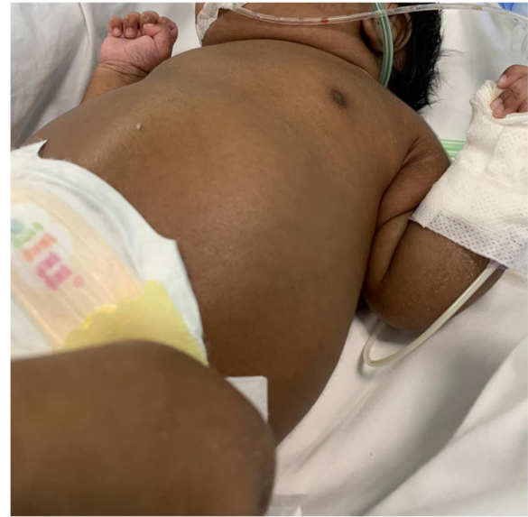
Fig. 1 Partial profile of the patient, severe abdominal distension with bilateral palpable nephromegaly

Postnatally, she suffered from severe respiratory distress syndrome due to pulmonary hypoplasia, which needed intubation, surfactant administration and invasive mechanical ventilation (MV, peak inspiratory pressure up to 26 cmH 2 O) for 10 days. Chest X-ray confirmed the typical patterns of lung hypoplasia (Fig. 2). On day 1, abdominal US revealed bilateral cystic nephromegaly, with the right kidney measuring 5.5 cm in length, and the left 6.2 cm. Renal function was moderately impaired, with glomerular filtration rate, obtained by the Schwartz formula, of 10.12 mL/min/1.73m 2 (k = 0.33). Oliguria (urine output below 1 ml/kg/h) was present in the first hours of life, and required, soon after birth, a progressively increasing dosage of diuretics and dopamine. Moreover, the newborn showed increased urinary excretion of sodium, and decreased of potassium, with consequent hyponatremia and hyperkalemia, that were corrected