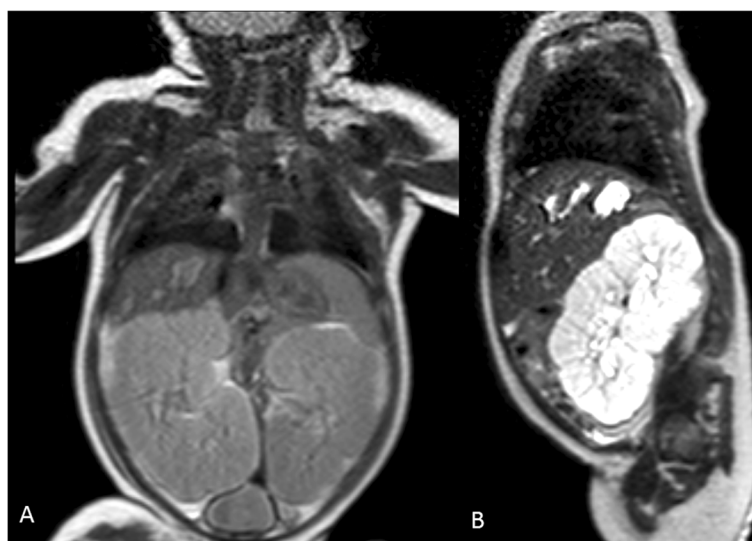
Fig. 3 Abdominal magnetic resonance imaging. a. T1 sequence, in coronal plane, shows enlargement of both kidneys (right 8.5 × 5.4 cm, left 8.2 × 5.4 cm), with altered structure and bulged margins, and hepatomegaly with at least two cystic lesions in segments VII and VIII. b. T2 sequence delayed enhanced image, in right parasagittal plane, shows enlarged kidney with inverted structure, and at least two cystic focal lesions in segments VII and VIII of the liver

Meanwhile, the genomic diagnosis of ARPKD by target NGS was obtained, and confirmed after Sanger sequencing. The homozygous mutation NM_138694.4: c.5323C > T (p.Arg1775Ter) of the PKHD1 gene was identified in the proband. Such variant, rarely associated with ARPKD [7–9], was inherited by both parents, who are heterozygous carriers of the same mutation. It causes a premature stop codon, at the amino acid 1775 of the encoded protein (which normally contains 4074 amino acids), leading thus to a severe truncation.