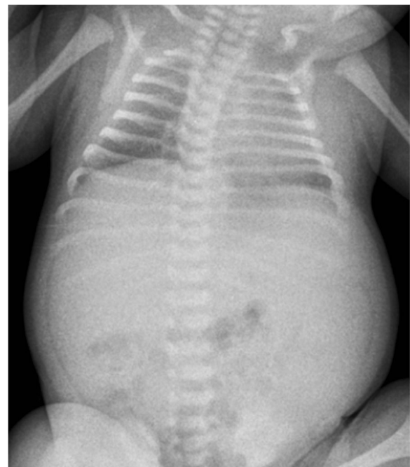
Fig. 2 X-ray: lung hypoplasia, with reduced expansion and diffuse bilateral accentuated bronchovascular markings, and severe abdominal distension due to visceromegaly (liver and kidneys)

with sodium chloride and a fluid restriction regimen. A rapid and progressive enlargement of both kidneys (maximum longitudinal diameter of around 8.5 cm for both) was noted on US, till the third week of life. Renal morphology was characterized by bilateral poor corticomedullary differentiation, and typical pepper-