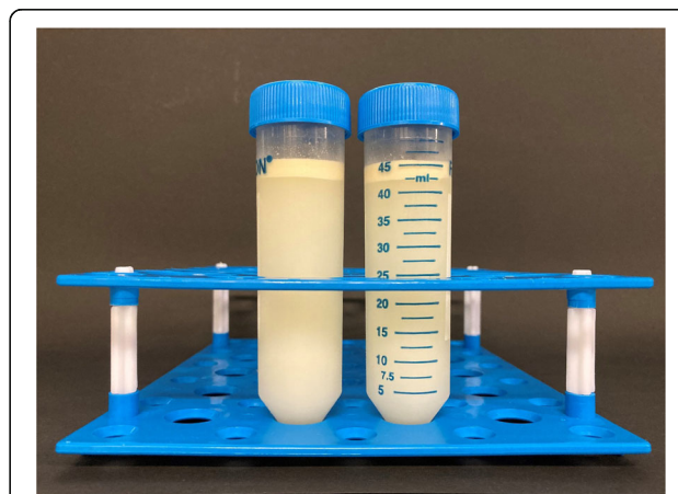
Fig. 1 Clearly visible separation of fat and fat-free fraction after centrifugation

In a time period of 8 years, we identified a total of six infants with congenital chylothorax. All six neonates were symptomatic at birth and showed severe respiratory distress. They needed stabilization of the respiratory situation via chest tube drainage and respiratory support. The decision, whether non-invasive (CPAP), conventional or high frequency ventilation has been employed, depended on the severity of respiratory failure.