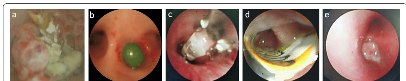
Fig. 1 The appearance of foreign bodies lodged in the bronchus after bronchoscopy. a Pine needle foreign body, surrounded by granulation tissue wrapped, and adhesion of serious infection. b Green gelatinous round foreign body with smooth surface. c LED wick foreign body, the surface is sharp. d The beginning of the candy paper foreign body is sharp, and the surrounding granulation is wrapped. e The blood supply of granulation tissue wrapped on the surface of unknown foreign body is rich

airway mucosal injury were treated with local adrenaline and thrombin, and if necessary, intravenous hemostatic drugs which is pituitrin was given and all were improved. No operation related massive hemoptysis was observed; 70 cases (11.2%) there was mild laryngeal edema, which improved after treatment with adrenaline and corticosteroids. No postoperative dyspnea was observed. There was no other serious complications