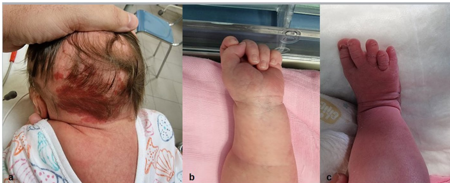
Fig. 3 a. Wide cutaneous vascular malformations posteriorly in the neck and occiput; b. Adducted thumb; c. Syndactyly of the right 2nd and 3rd toes, broad 1st, proximal set of the 4th, and clinodactyly of the 5th ones

adequate weight and length growth at age 1 month. After 6 days, the baby presented with recurrent vomiting. Thus, she was readmitted to our NICU, where an abdominal US was soon carried out. This showed pyloric muscle thickness (MT) of 4–5 mm, and channel length (CL) 18 mm, according with a hypertrophic pyloric stenosis (HPS) diagnosis. She then begun intravenous rehydration and whole parenteral nutrition, and underwent Ramstedt pyloromyotomy 3 days later. Feeding through nasogastric tube was started on day 3 after surgery, and enteral nutrition was gradually increased. The patient was discharged 1 week after the surgical operation, tolerating full oral feeding. She had a normal clinical evolution, with adequate weight gain, and is included in a multidisciplinary follow-up. She currently is 2 months and 24 days old, and her anthropometric measures, according to World Health Organization growth chart for neonatal and infant close monitoring [4], are: weight 4960 g (14th