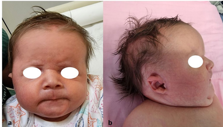
Fig. 2 a. Patient's front view: coarse face and asymmetry due to left hypoplasia, high and prominent forehead, hypoplastic supraorbital ridges, sparse and friable hair, eyebrows and eyelashes, wide and depressed nasal bridge, bulbous tip, anteverted nares, long philtrum; b. Lateral view: bilateral small, dysplastic, crumpled and posteriorly rotated ears with thickened helices and right preauricular tag